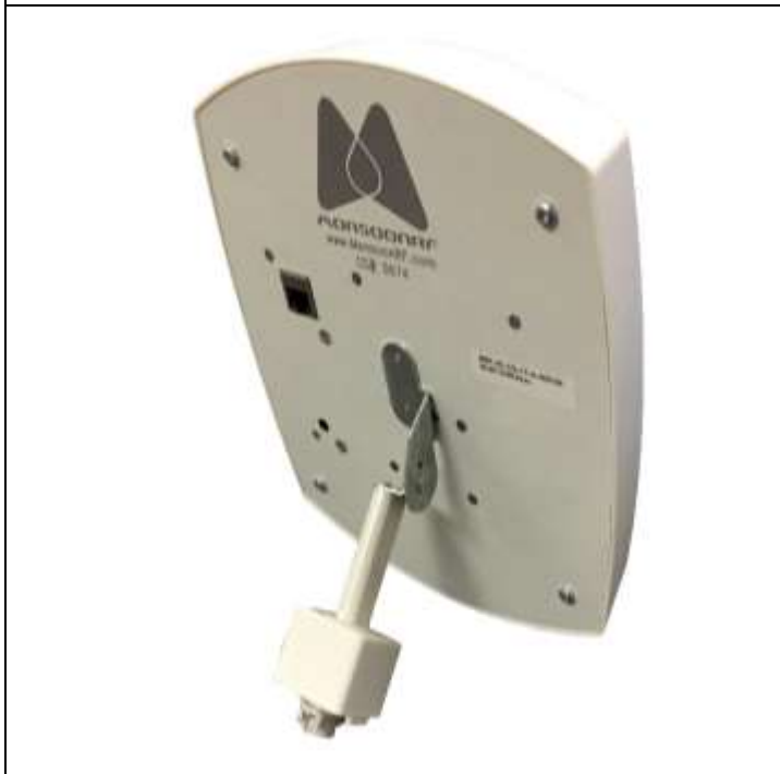
AA-1B Active Antenna – Back Showing RJ-45 connector for Power over Ethernet (PoE) and Ethernet connection.