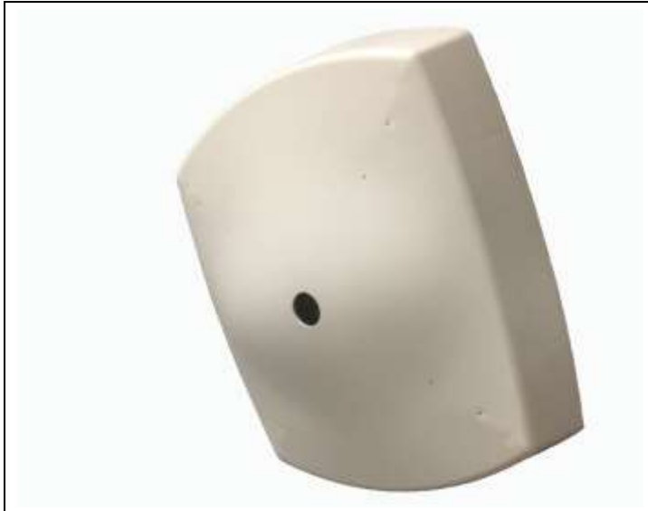
AA-1B Active Antenna – Front Showing the center located Proximity Sensor.